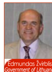
Edmundas Žvirblis Government of Lithuania