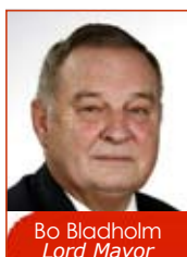
Bo Bladholm Lord Mayor