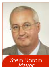
Stein Nordin Mayor