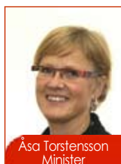
Åsa Torstensson Minister